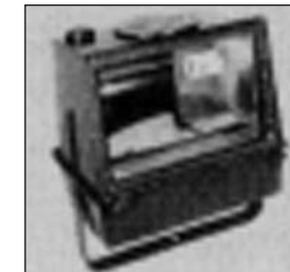
Directional Luminaire HPS & MH