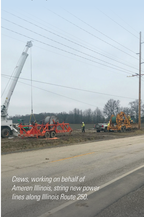
Crews, working on behalf of Ameren Illinois, string new power lines along Illinois Route 250.

This $2.6 million project will enhance service reliability for nearly 600 customers in Noble and the Village of Clay City.