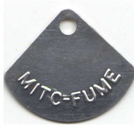
Fumigant Treated (Add Behind Inspection Tag) (Tag to Specify Treatment)