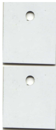
Reject/Priority Pole (Pole needing immediate attention) (Two White Tags)