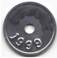
G/L Inspected and Externally G/L Treated