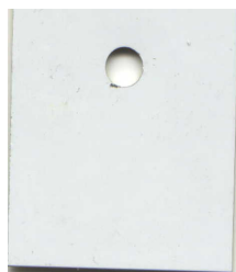
Reject/Change Out Pole without enough structural strength to remain in service White Tag