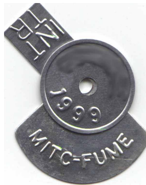
Example G/L Inspected and Externally G/L Treated Fumigant and Internally Treated