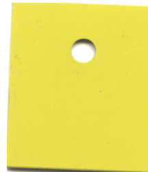
Reject/Reinforcable (Pole without enough structural strength to remain in service, but able to be reinforced) Yellow Tag