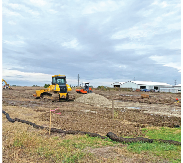
Our new southwest Champaign substation is a prototype that will serve as a design model for future substation construction throughout the Ameren Illinois service territory.

When this substation goes into service next spring, we'll have the capability to reroute power from other substations in the area to reduce the duration of outages and meet demand for reliable energy in the Champaign region.