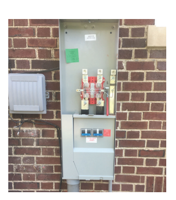
400 Amp With Breaker Safety Lever By-Pass