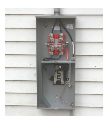
200 Amp With Breaker Safety Lever By-Pass