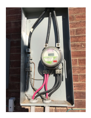
400 Amp Safety Lever By-Pass