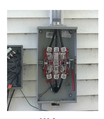
200 Amp Safety Lever By-Pass