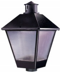
Colonial Post Top