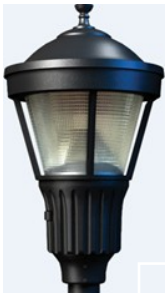
Early American Post Top