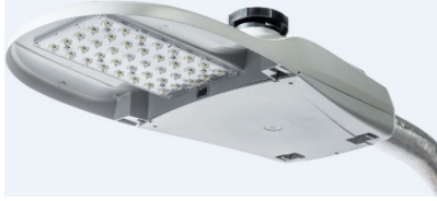
Bracket Mount LED 100W & 250W Equiv