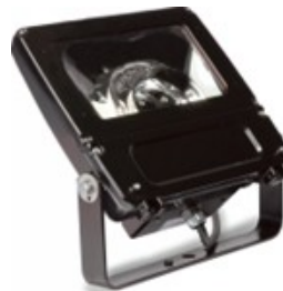
Figure 3-3 GE EFN Model-LED 250W EQV (old)