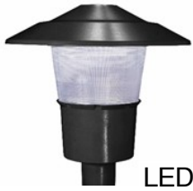
LED / HPS