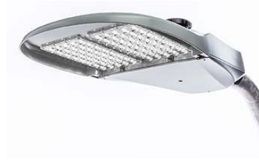
Bracket Mount LED 400W Equiv