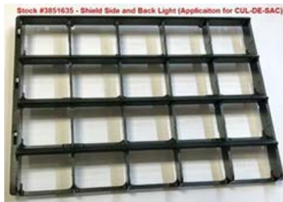
Light Shield – Shield Back and Side (CUL_DE_SAC)