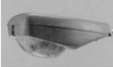
Cobra/Enclosed Horizontal HID – Semi-Cutoff