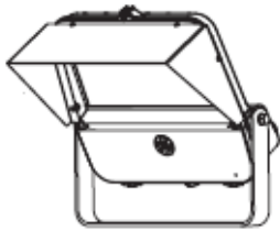
Figure 3-4. Light Shield ONLY needed based on request MUST SELECT THE CORRECT SHIELD FOR EACH MODEL OF LED LUMINAIRE SEE MODEL (*)