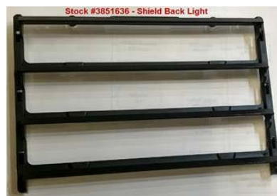
Light Shield – Shield House or Back

Note: Order light shield if there is a complaint of light trespass. Stock #3851675 (block back and side) and stock #3851676 (block back or house) are setup for "J" series LED. The "J" series LED is labeled with additional identification decal "J" next to the wattage decal shown above. Stock #3851635 and #3851636 work only on LED without identification decal "J" LED.