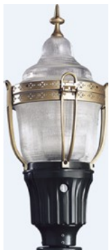
Aspen Post Top