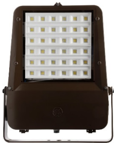
Figure 3-2 GE EFH Model-LED 400W EQV (Old) GE EFH Model-1000W EQV (Current)