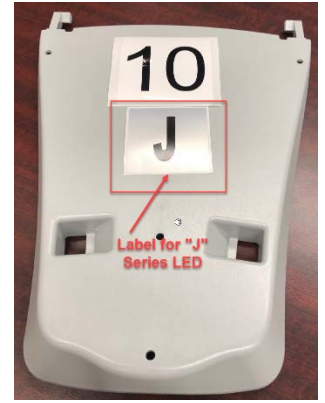
Bracket Mount LED "J" Series