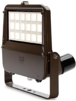
Figure 3-1. Directional/Flood LED 250W&400W Equivalent (GE EFM Model)