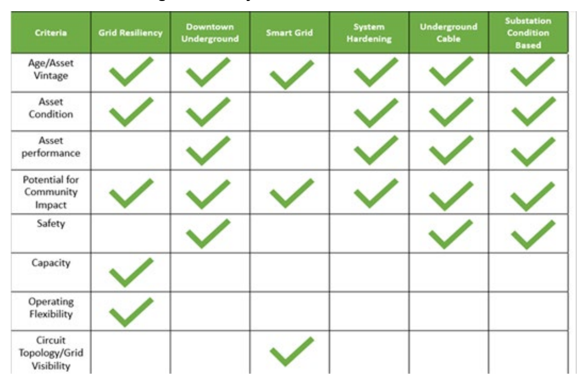
Figure 7.4 Project Evaluation Framework