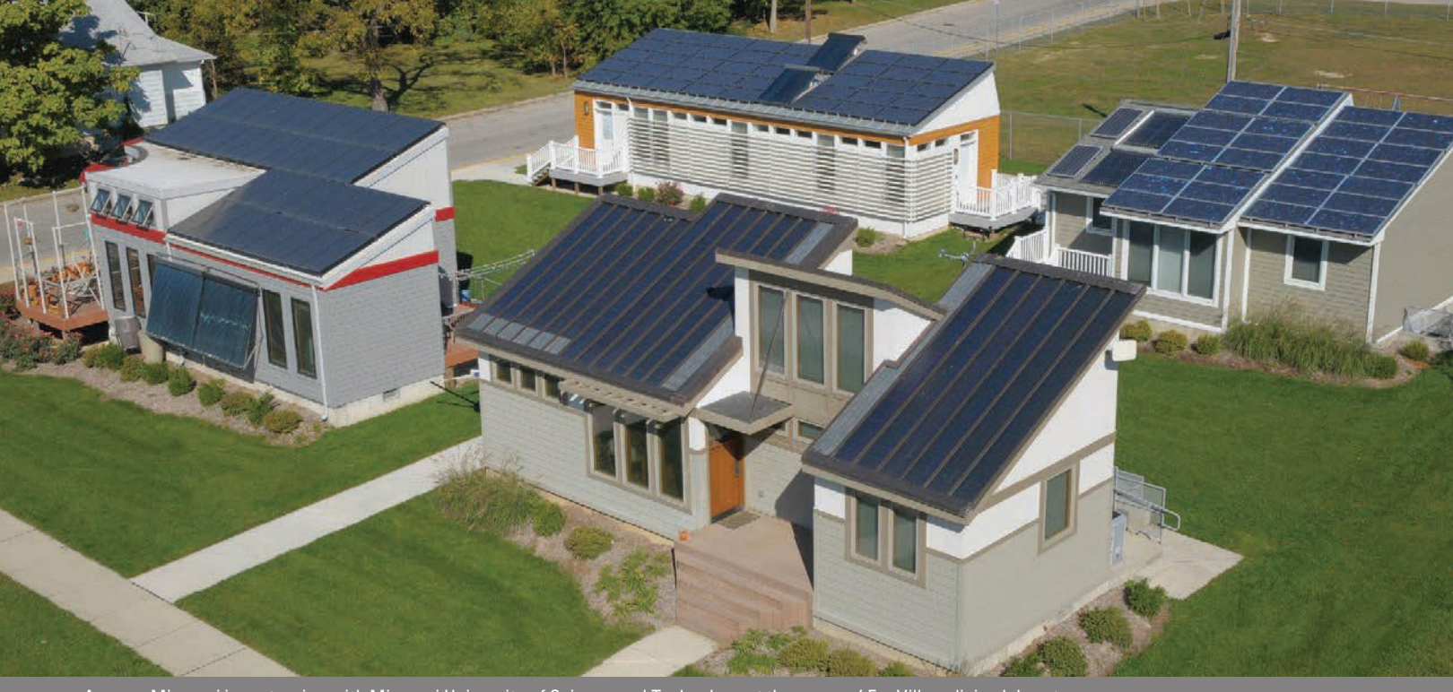
Ameren Missouri is partnering with Missouri University of Science and Technology at the campus' EcoVillage living laboratory.

To ensure we deliver on our customer-first commitment in an affordable manner, we will implement the following strategies: